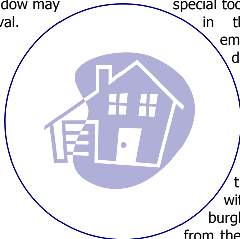
Fire and smoke can make escape options impassable, so all household members should have more than one easy means to escape during a fire.

When windows with burglar bars are the only means of escape to the outside from a sleeping room, at least one of the windows must be equipped with a safe "quick-release" burglar bar that can be opened from the inside without the use of any special key or tools.