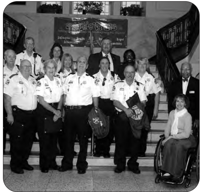
Volunteer Road Patrol Recognition 12/9/09