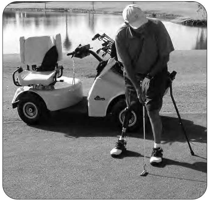
Solo Rider Golf Car

A serendipitous result of this examination was a redefining of the mission of CAPI by City Council in 1995 and its transformation to that of being more pro-active. In doing so, the City reaffirmed and better defined its commitment to persons with impairments. To its credit, the Council also saw fit to provide access to funding to the Committee from the state mandated reserve which is a set-aside of fines from handicapped parking space violations. CAPI has thus become an integral part of defining the future course of the City of St. Petersburg in ensuring equal access to persons with impairments.