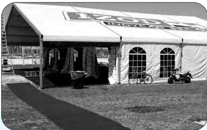
Mobi Mat in use at Honda Grand Prix

2008 Project Funding Recommendations & Accomplishments continued on page 4