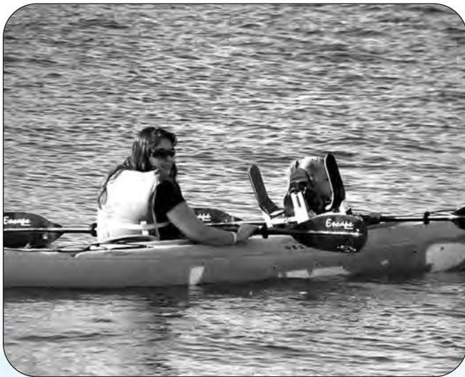
Therapeutic Recreation's Adaptive Kayaking