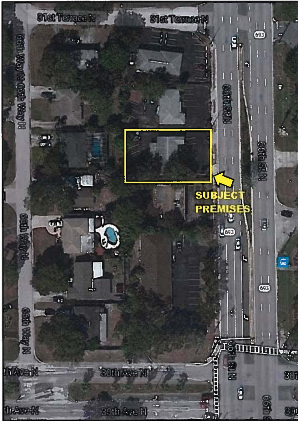
ILLUSTRATION OF PREMISES