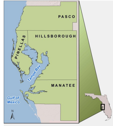
Figure 1. Map of the four county region served by the CSAP.

recommendations for local governments and regional agencies as they make decisions about responding to climate change and associated SLR. The CSAP has assessed the best available scientific data to determine a regional set of SLR projection scenarios through 2100. With this shared projection, local governments can coordinate, develop, and implement appropriate coastal adaptation and risk reduction strategies. This document briefly explains the technical methods used to produce SLR projections and offers the CSAP's rationale for the most appropriate SLR projections to use for planning and policymaking throughout the Tampa Bay region.